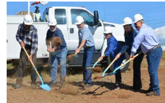
May 2018, Groundbreaking Ceremony for the Del Valle Water Treatment Plant Ozonation Project

Control strategies for seasonal taste-and-odor (T&O) control caused by algal growth in SBA water include periodic copper sulfate application to source water by the Department of Water Resources and use of Powdered Activated Carbon at both conventional treatment plants. Zone 7 is in the process of designing and installing an advanced ozone treatment process at each of its treatment plants to provide more effective treatment for T&O and algal toxins while reducing disinfection by-products and improving overall water quality. The new ozone treatment process should come online over the next few years.