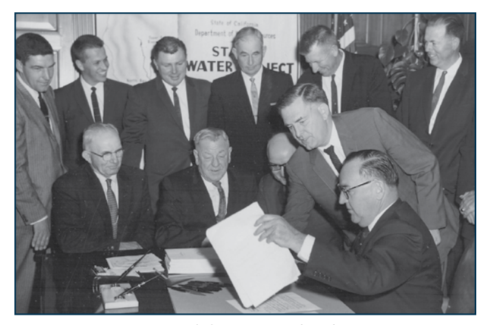
1961: In signing ceremonies with then-Governor Edmund G. Brown, Zone 7 enters a historic contract with the State for yearly entitlement to 40,000 acre-feet of water from the South Bay Aqueduct. This is increased to 46,000 acre-feet in 1963.

Almost simultaneously, the California Water Resources Development Bond Act was approved by state voters on November 8, 1960. The Zone 7 water contract and related negotiations continued with the state as well as with local water retailers: California Water Service Company in Livermore; the City of Livermore when it decided to provide water service to new areas north of Interstate 580 (Springtown); the Lawrence Radiation Laboratory (later renamed as the Lawrence Livermore National Laboratory) to back up its water supply; the Veterans Hospital on Arroyo Road south of Livermore; the Valley Community Services District (now the Dublin San Ramon Services District); and the City of Pleasanton.