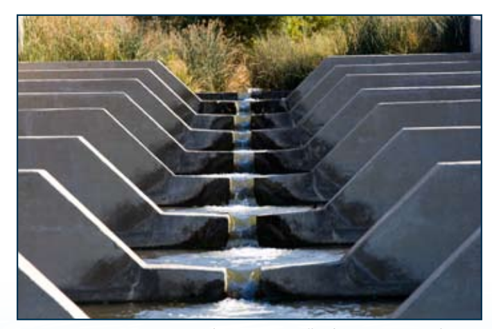
Zone 7's participation in efforts to restore steelhead trout to portions of the Alameda Creek Watershed led to installation of fish ladders along Arroyo las Positas and Arroyo Mocho in the Valley.

To help reduce hardness of groundwater supplies, the agency in 2007 broke ground on its Mocho demineralization plant in Pleasanton, which will use reverse-osmosis membrane technology to treat up to 7.7 million gallons of groundwater a day pumped from a series of nearby Zone 7 wells.