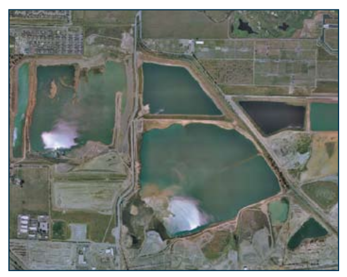
Abandoned gravel quarries between Pleasanton and Livermore hold a key to groundwater recharge and floodwater detention.

In the 1970s, Kaiser Sand and Gravel had proposed a garbage landfill as the firm's quarry reclamation plan for its mined-out sand-and-gravel pits. Zone 7 objected, arguing that the propriety of placing all that garbage in the center of the Valley's valuable groundwater resource was dubious at best.