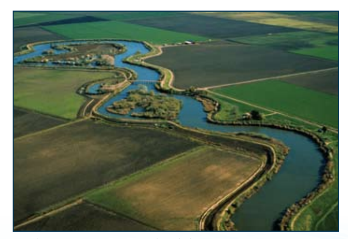
The Sacramento-San Joaquin Delta, which conveys State Water Project water, has long faced significant ecological challenges.

After the drought in the late 1970s, deficiencies of the State Water Project became more evident, especially in light of increasing water demand. Part of the original State Water Project included a Peripheral Canal around the Delta to move water to the state's Delta Pumping Station more efficiently. Water released from Lake Oroville would be diverted into the canal to preserve its quality and reliability. Some water would be released into the Delta to provide a flow from east to west to stabilize overall water quality and quantity. But