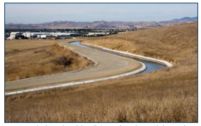
Zone 7 has long recharged the Valley's groundwater basin with the unused portion of State Water Project water from the South Bay Aqueduct.

Later, in the early 1980s, Zone 7's Board adopted policies for the unincorporated area surrounding the cities aimed at curtailing the proliferation of on-site sewage disposal systems such as septic tanks to serve new development.