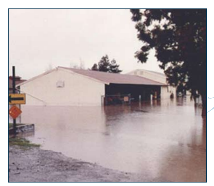
The El Charro Ranch area experienced major floods in 1998.

Zone 7 made big strides during the 1990s to satisfy anticipated water demands through planned Valley buildout in 2035 and, at the same time, to improve water reliability throughout the Zone. This was achieved largely through a program, financed by Dougherty Valley and other developers, to acquire additional State Water Project rights along with groundwater-storage capacity in Kern County. This began a new era of developer-funded acquisition that, by 2004, entitled Zone 7 to a total 80,619 feet of State Water Project water annually – twice the original 1961 entitlement.