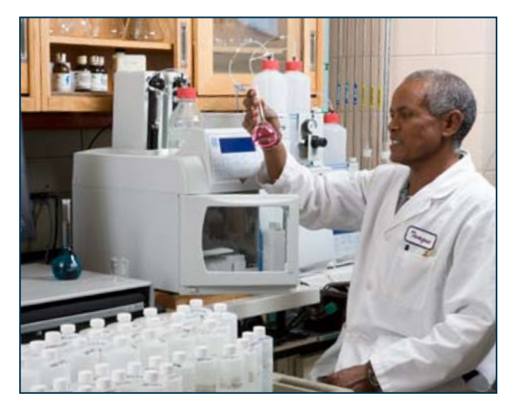
Zone 7 regularly tests water quality.

Drought conditions in the early part of the decade prompted Zone 7 to establish a Rate Stabilization Reserve to help avoid sharp rate fluctuations during times of drought or emergency supply outages.