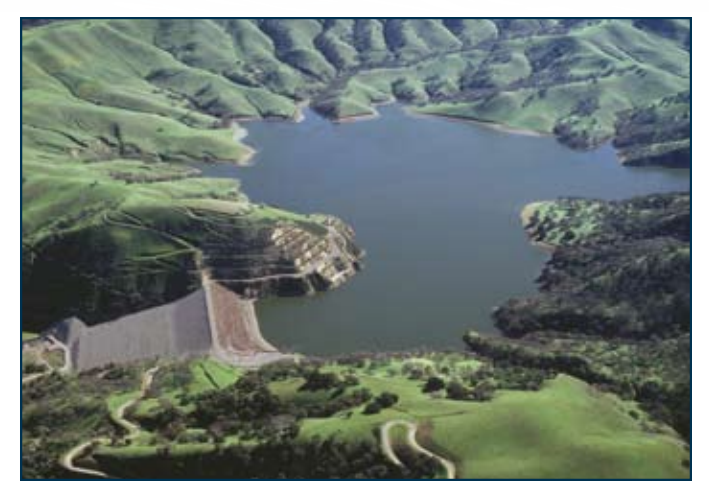
As part of the South Bay Aqueduct and State Water Project, the State Department of Water Resources in 1968 built Lake Del Valle for water storage, flood control, recreation and fish-and-wildlife enhancement.

Pleasanton discharged treated wastewater into the arroyos. The Regional Water Quality Control Board saw that even upgrading treatment standards would not mitigate the waterquality impacts on the local surface and ground waters, Alameda Creek, the groundwater basin in the Fremont area and the southern San Francisco Bay where Alameda Creek emptied.