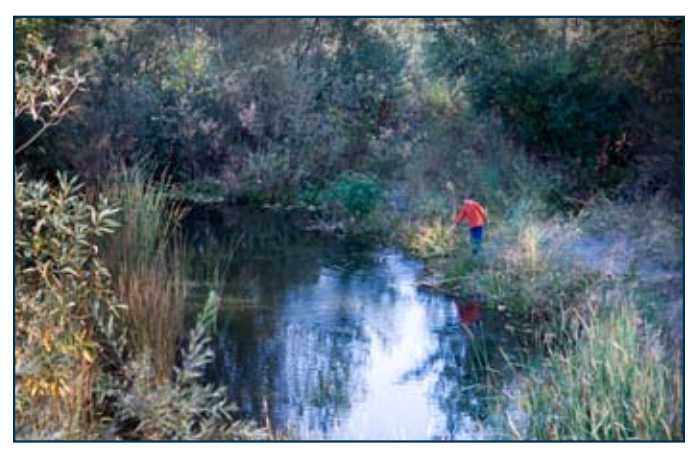
Local creeks provide recreational benefits.

1982 and 1983 were wet years. There was some street flooding in Pleasanton when the enlarged Arroyo de la Laguna and Alamo Creek along I-680 began to fill with natural runoff and flood-control releases from Lake Del Valle. The bottleneck was the lower reach of Arroyo de la Laguna between Bernal Avenue and I-680, which was subsequently improved by the Hacienda Business Park developers and Ponderosa Homes.