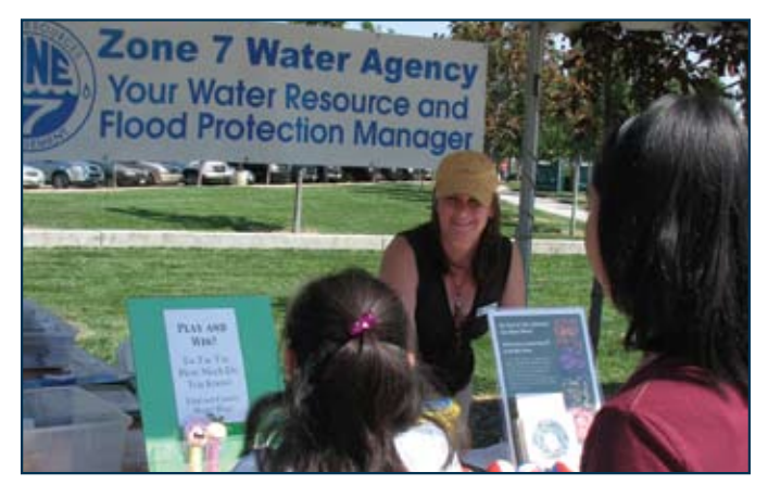
2006: Day on the Glen Festival in Dublin

The first years of the new millennium have focused on improved water reliability, enhanced water quality and more effective and environmentally friendly flood protection, along with expanded public outreach and improved Water Science in the Schools programs.