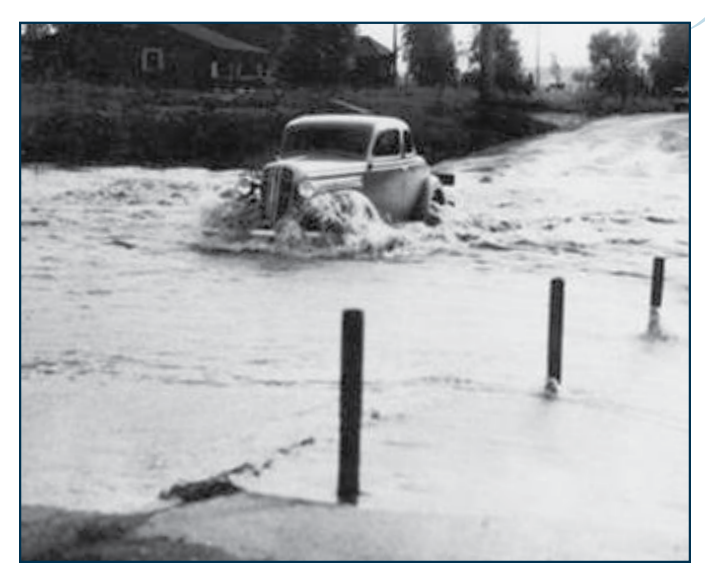
Late 1930s: Holmes Street at Arroyo Mocho in Livermore.

There were ongoing efforts to create a zone encompassing Murray and Pleasanton Townships that contained the cities of Livermore and Pleasanton. This rural, largely agricultural area encompassed more than half of the land in Alameda County, but less than 4 percent of the county population. Further agricultural or municipal development potential was severely constrained by inadequate drainage and water supply. Flooding was common. Groundwater was the only water source, and more water was being pumped than was replenished annually – meaning the water table was dropping. Something had to be done.