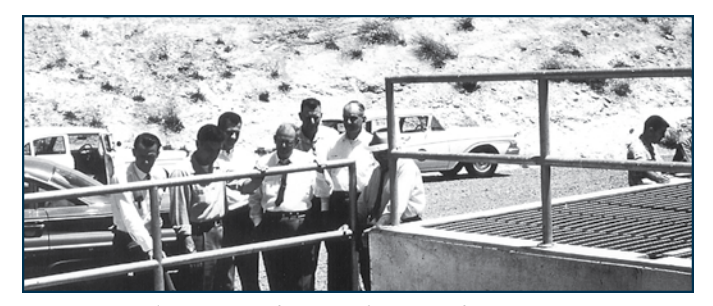
Early Zone 7 Board tours South Bay Aqueduct construction.

On Sept. 27, 1960, 82 percent of voters within Zone 7 approved $5.67 million in general obligation bonds to begin to address insufficient water supply, poor drainage and flood hazards. The financing plan was evenly split between water supply and flood control. Part was tied to the state's planned South Bay Aqueduct water-supply project, which was to serve portions of the East Bay and the South Bay with drinking water. Among other things, it included funding for Zone 7's Patterson Pass Water Treatment Plant, along with transmission pipelines, wells and groundwater-recharge facilities.